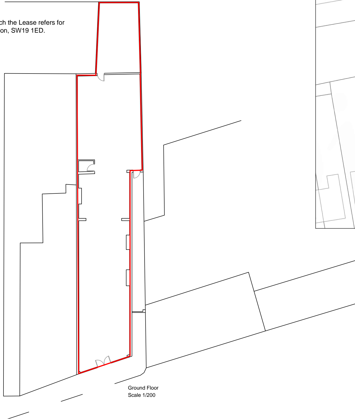
Ground Floor Scale 1/200

Note: The area edged in red on the plan indicates that to which the Lease refers for the property 147 Merton Road, South Wimbledon, London, SW19 1ED.